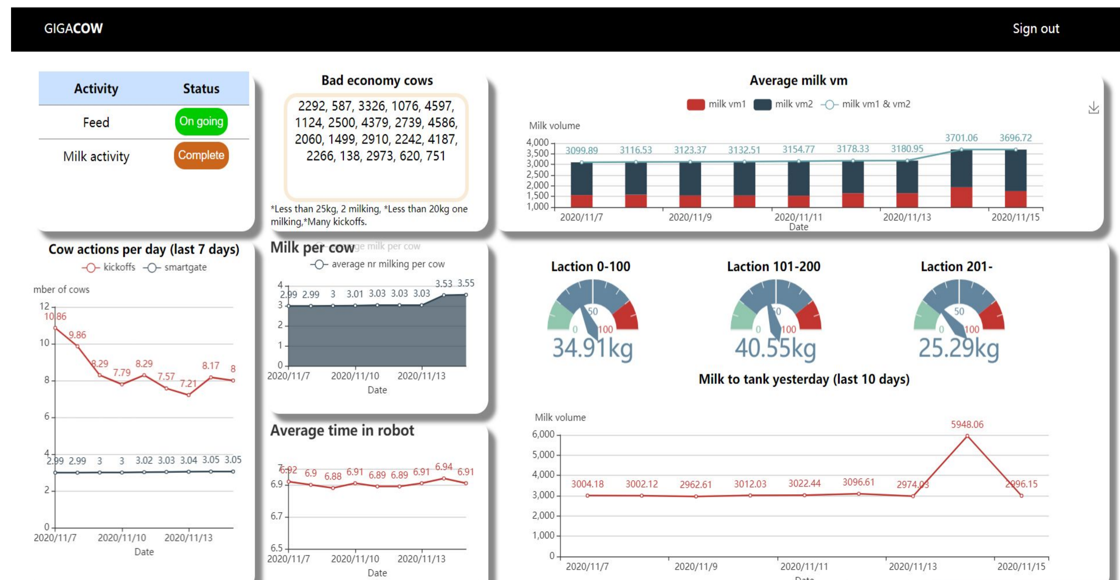
Figure 2. The layout of the current dashboard.

Tomas Klingström tomas.klingstrom@slu.se